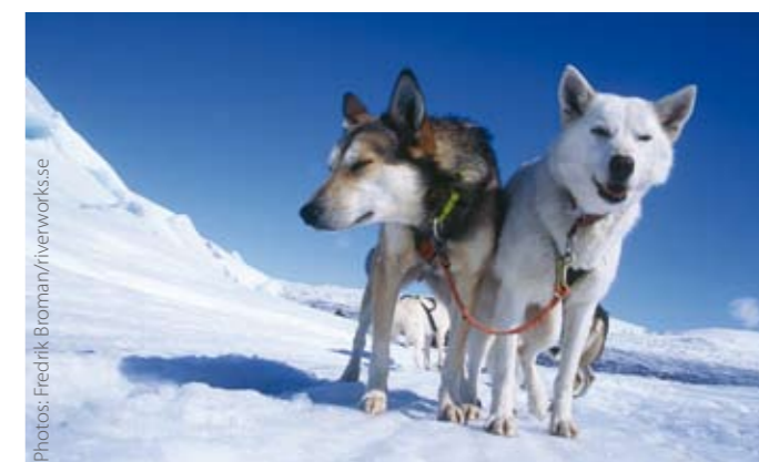
Winter week in Swedish Lapland

Examples of other activities which we offer;