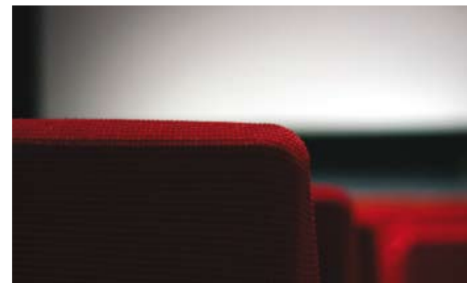
Conference in Swedish Lapland